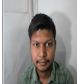
Test Day Photo